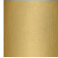
Brass - BRA