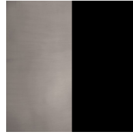
Pewter/Black - PWB